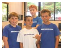
Today's Speakers: The Honu Heroes STEM Academy Kihei Charter School